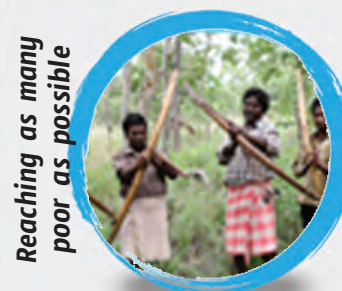
Reaching as many poor as possible