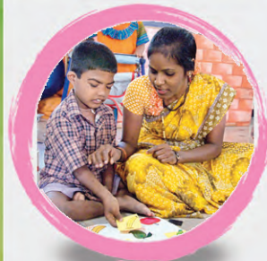
Concern for the poor and needy