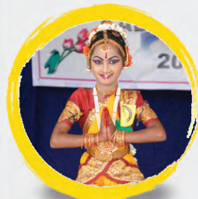
Pursuit of excellence in work