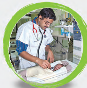
Work beyond duty